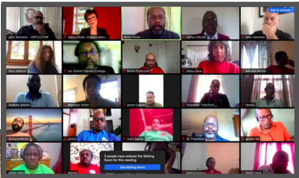
Trinidad & Tobago workshop