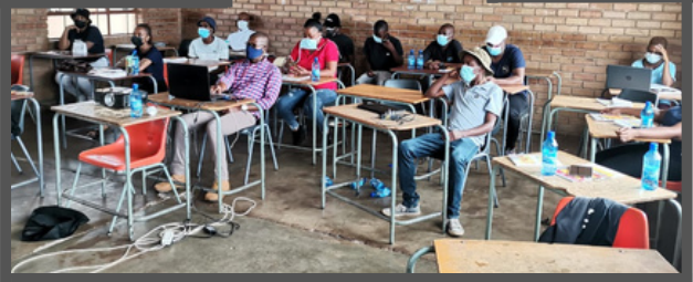
South Africa workshop