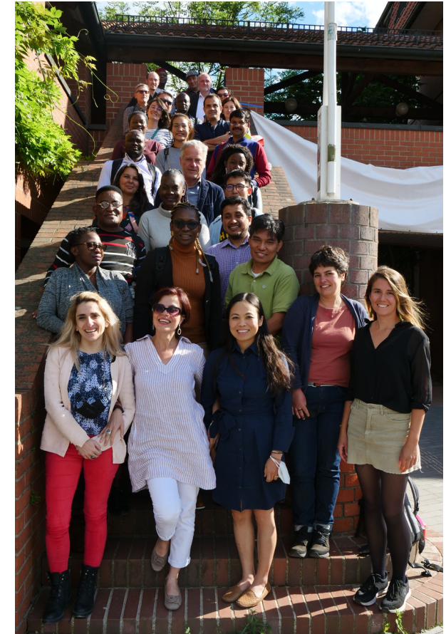
GTTT workshop, May 2022, Kassel

As of May 2023, the Online Academy has developed 87 local trainers, in 31 countries, across all continents.